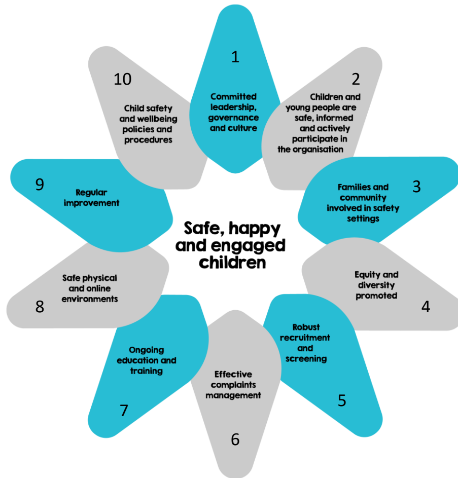
Wheel of Child Safety