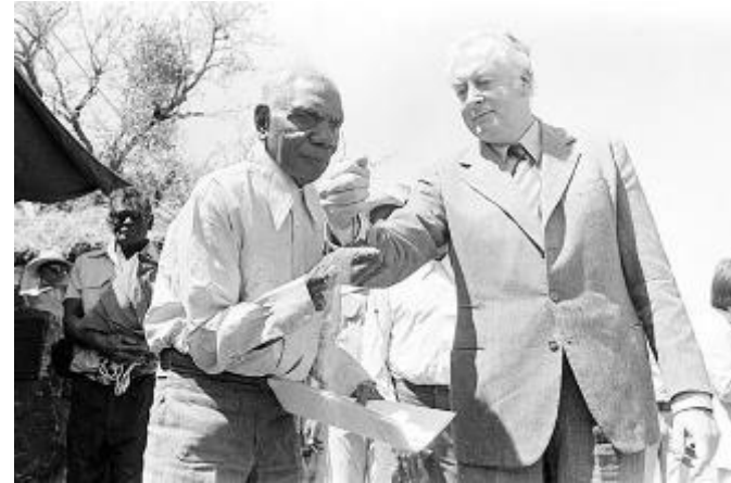
Gough Whitlam & Vincent Lingiari 1976